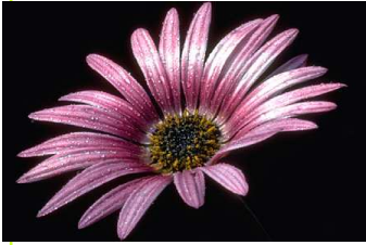
We do this One Day at a Time