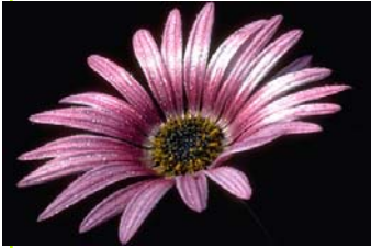
We do this One Day at a Time